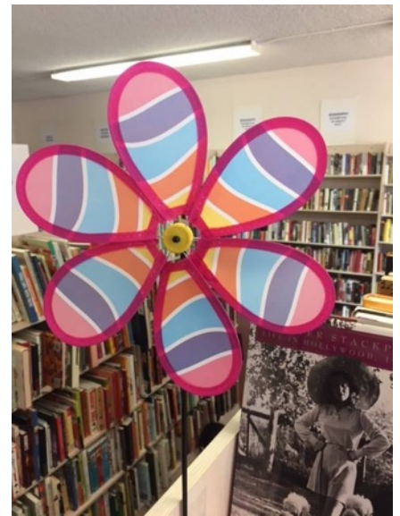
Spring flower pinwheels mark the sales spots at the Book Place anniversary sale!